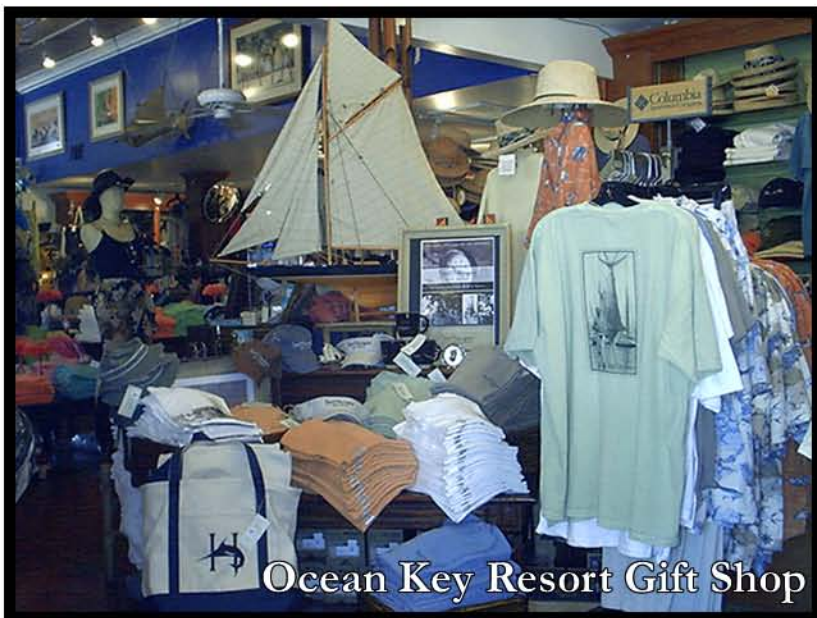
Ocean Key Resort Gift Shop