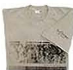
"Literary Legend" T-Shirt Catalog No.: T-PIF1