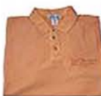
Signature Travel Polo Catalog No.: PS-EHTT