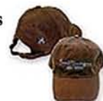
Signature Unconstructed Cap Catalog No.: UC-EHKW/H