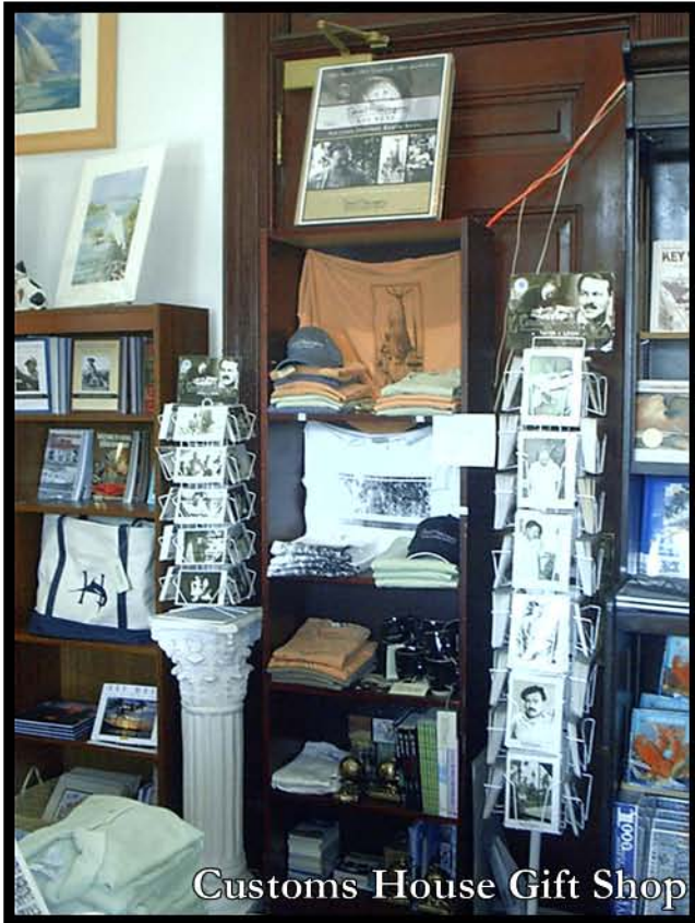
Customs House Gift Shop

This merchandise is currently available for purchase in multiple outlets across Key West.