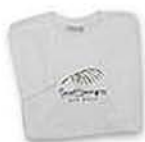
Tropical Signature T-Shirt Catalog No.: T-EHKWP