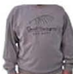
Tropical Signature Sweatshirt Catalog No.: SS-EHKWP