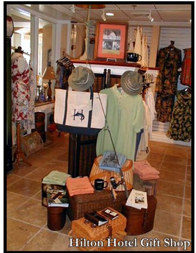
Hilton Hotel Gift Shop