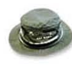
Signature Bucket Hat Catalog No.: BH-EHKW