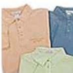
Tropical Signature Polo Catalog No.: PS-EHKWP