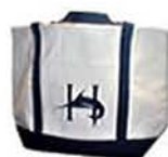
Hemingway Logo Canvas Tote Catalog No.: TB-H